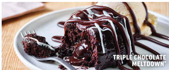
TRIPLE CHOCOLATE MELTDOWN®

The perfect size of a warm dark chocolate brownie with nuts. Served with vanilla ice cream and drizzled with hot fudge. 2.50