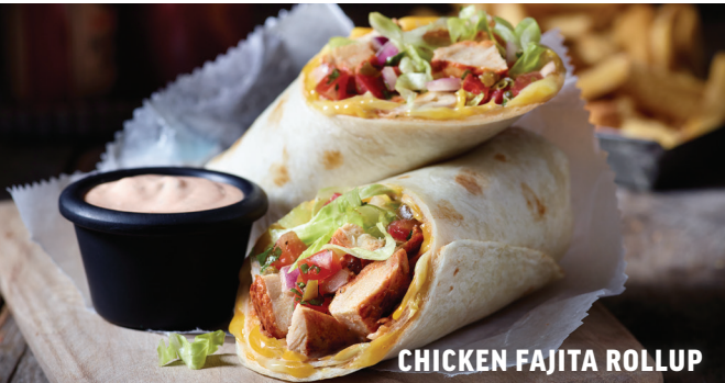
CHICKEN FAJITA ROLLUP

Cajun seasoned diced chicken with crisp lettuce, a blend of cheddar cheeses and house-made pico de gallo wrapped in a soft flour tortilla. Served with a side of our Mexi-ranch dipping sauce. 15.99