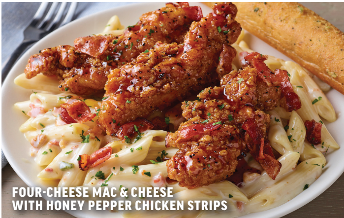
FOUR-CHEESE MAC & CHEESE WITH HONEY PEPPER CHICKEN STRIPS