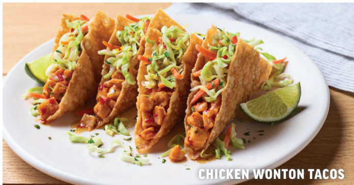
CHICKEN WONTON TACOS