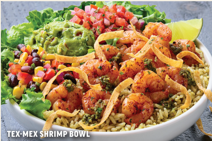
TEX-MEX SHRIMP BOWL

Smother it with melted cheddar cheese for 1.99 more