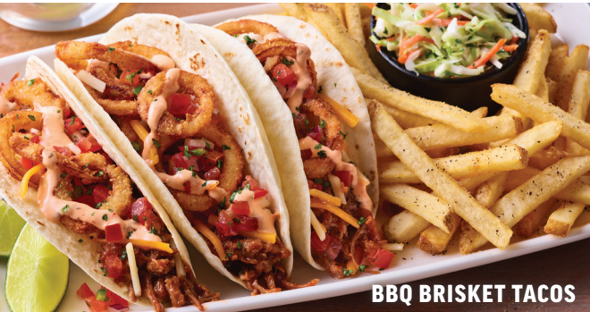
BBQ BRISKET TACOS

Bursting with big southwest flavour, flour tortillas are grilled then filled with shredded beef barbacoa, sweet Memphis BBQ sauce, a blend of cheddar cheeses and pico de gallo. Topped with crispy onions, a drizzle of our Mexi-ranch sauce and cilantro. Served with coleslaw. 16.99