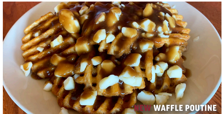
NEW WAFFLE POUTINE