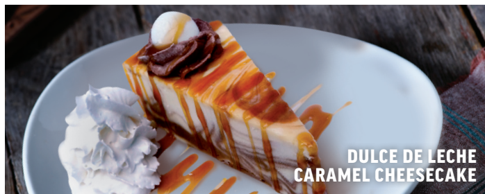
DULCE DE LECHE CARAMEL CHEESECAKE