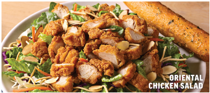
ORIENTAL CHICKEN SALAD

Add 14 Sautéed Cajun Seasoned Shrimp 4.99