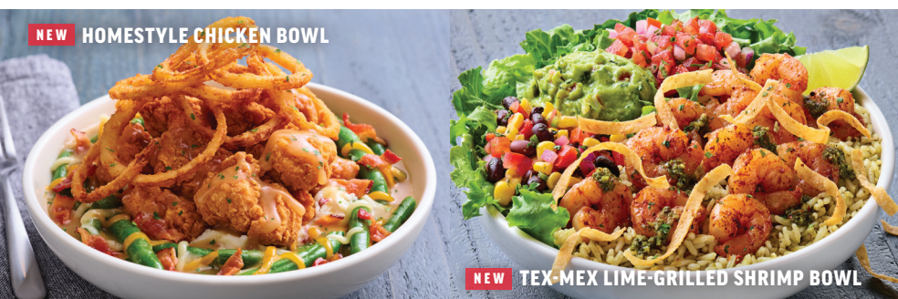
NEW HOMESTYLE CHICKEN BOWL