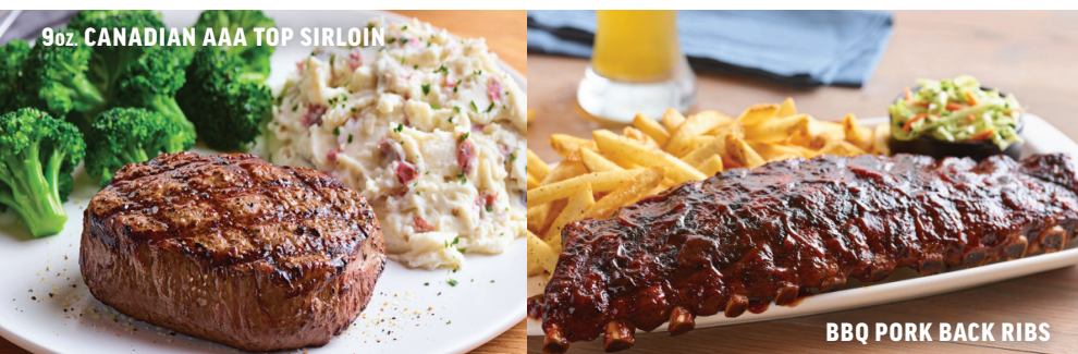
9oz. CANADIAN AAA TOP SIRLOIN