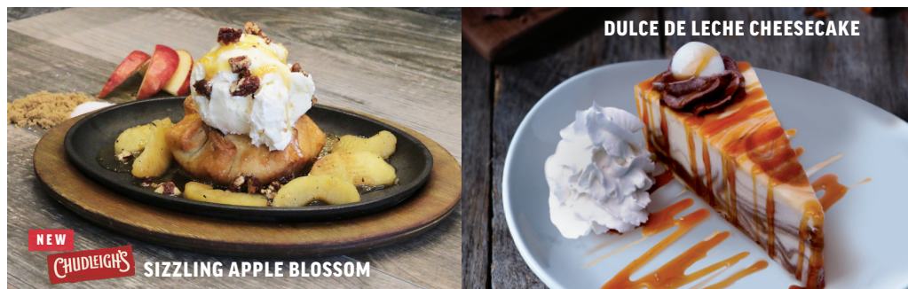
NEW CHUDLEIGH'S SIZZLING APPLE BLOSSOM