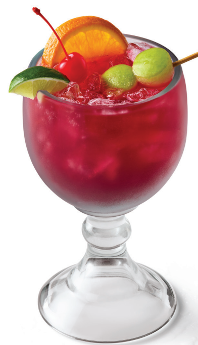
RED APPLE SANGRIA