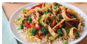
CHICKEN WONTON STIRFRY