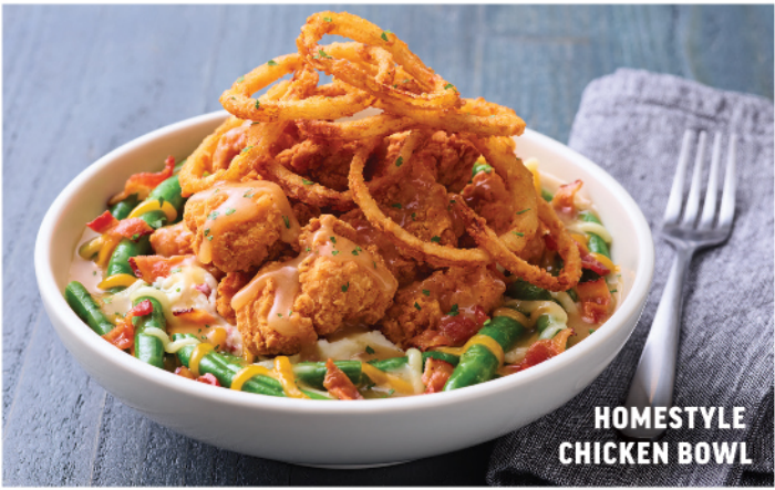
HOMESTYLE CHICKEN BOWL