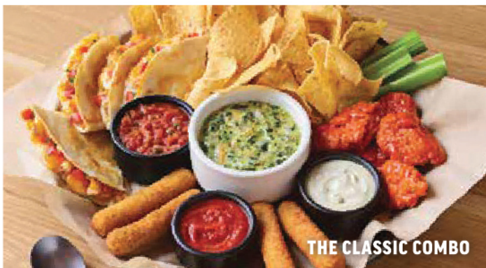
THE CLASSIC COMBO