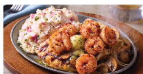
BOURBON STREET CHICKEN & SHRIMP