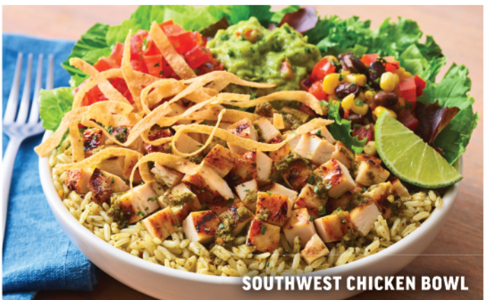
SOUTHWEST CHICKEN BOWL

Grilled chipotle lime chicken on mixed greens and cilantro rice with house-made pico de gallo, black bean corn salsa and guacamole. Topped with chimichurri and tortilla strips. 18.49