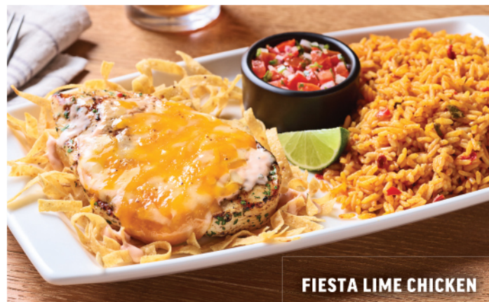
FIESTA LIME CHICKEN

A 6oz. grilled chicken breast topped with sautéed peppers, onions, mushrooms, and melted cheddar and Swiss cheeses. Served with house-made red-skinned garlic mashed and seasonal vegetable. 20.99