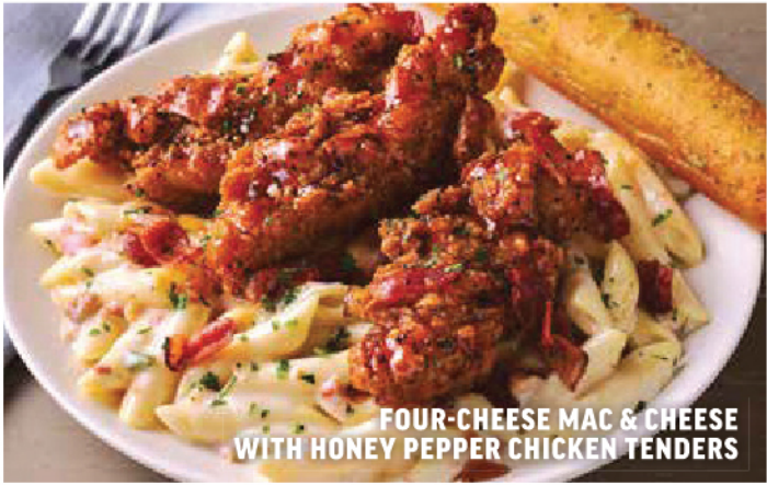
FOUR-CHEESE MAC & CHEESE WITH HONEY PEPPER CHICKEN TENDERS

A sweet and savoury take on comfort food, four-cheese Mac & Cheese is topped with bacon and crispy chicken tenders tossed in our house-made honey pepper sauce. 20.99