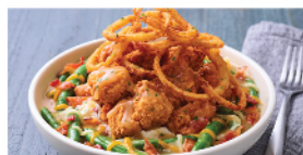
HOMESTYLE CHICKEN BOWL