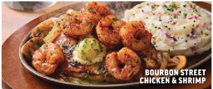
BOURBON STREET CHICKEN & SHRIMP