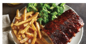
1/2 RACK BBQ PORK BACK RIBS choice of 2 sides Make it a full rack for $5 each per entrée