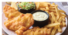
2 PIECE HAND BATTERED FISH & CHIPS make it a 3 pc platter for 3.00 each per entrée