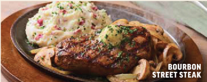
BOURBON STREET STEAK

Hand-cut Canadian top sirloin* tips covered with mushrooms and garlic cloves. Served sizzling on a cast iron platter with house-made red-skinned garlic mashed and seasonal vegetable. 28.99