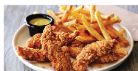
CHICKEN STRIPS PLATE make it a platter for $3 each per entrée