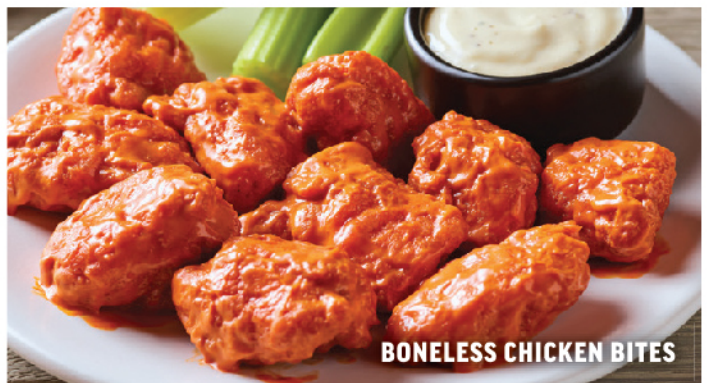
BONELESS CHICKEN BITES