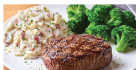
7 OZ CANADIAN TOP SIRLOIN* choice of 2 sides