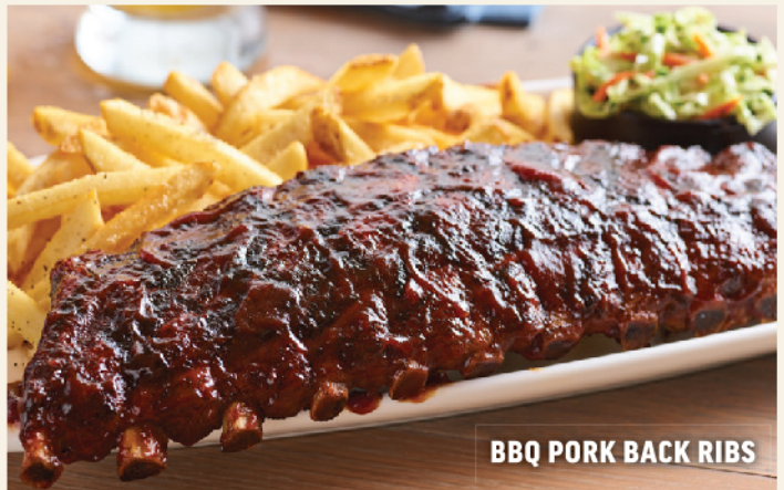
BBQ PORK BACK RIBS

Slow cooked to fall-off-the-bone tenderness and slathered with our Memphis BBQ sauce. Served with your choice of two sides. 29.99