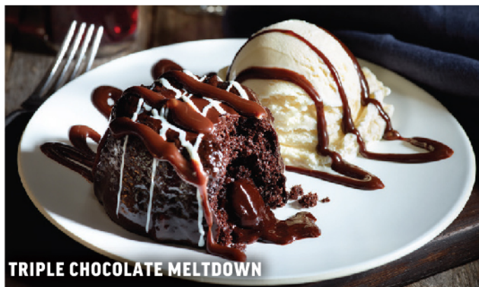
TRIPLE CHOCOLATE MELTDOWN