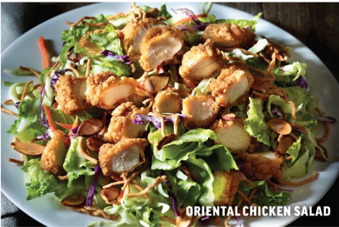
ORIENTAL CHICKEN SALAD

Crisp romaine in garlic Caesar dressing topped with grilled chicken breast, bacon, croutons, and Parmesan cheese. 18.49