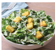
TWO SIDE SALADS HOUSE OR CAESAR

START WITH 2 SIDE SALADS OR 1 APPETIZER TO SHARE