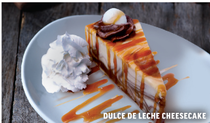
DULCE DE LECHE CHEESECAKE

Chocolate cake filled with a fudge center and topped with dark and white chocolate. Served with vanilla ice cream and fudge. 8.99