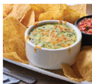
SPINACH & ARTICHOKE DIP