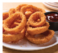
CRUNCHY ONION RINGS