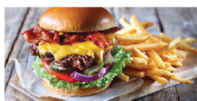
CLASSIC BACON CHEESEBURGER