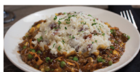
APPLEBEE'S HOMESTYLE SHEPHERD'S PIE